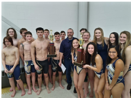
Congratulations to the NDHS Boys and Girls Swim Team! SOC Champs!!!!